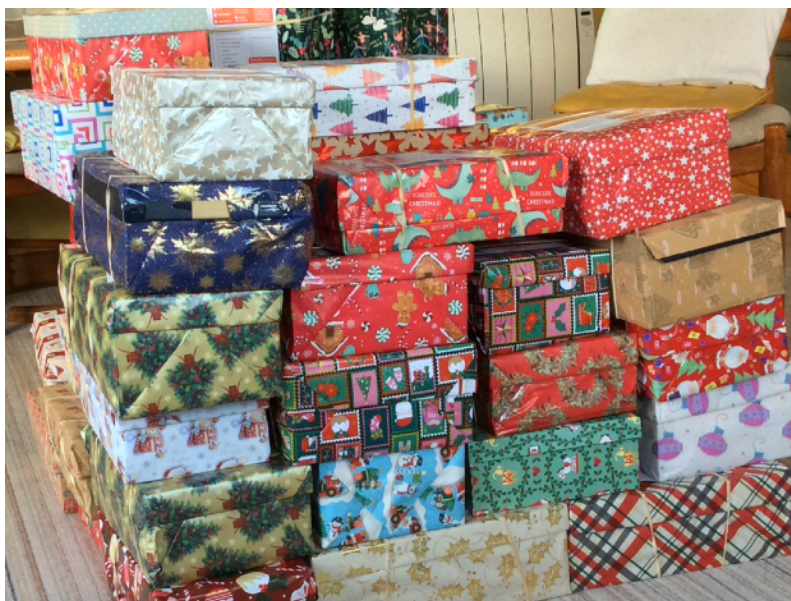
75 Shoeboxes-stuffed to the brim from Montrose Trinity.